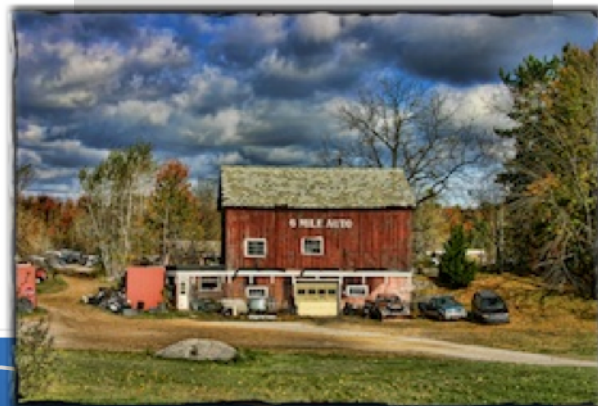
"6 Mile Auto" by Joy Hein

Photography Trivia: When does the first known pinhole camera date back to?