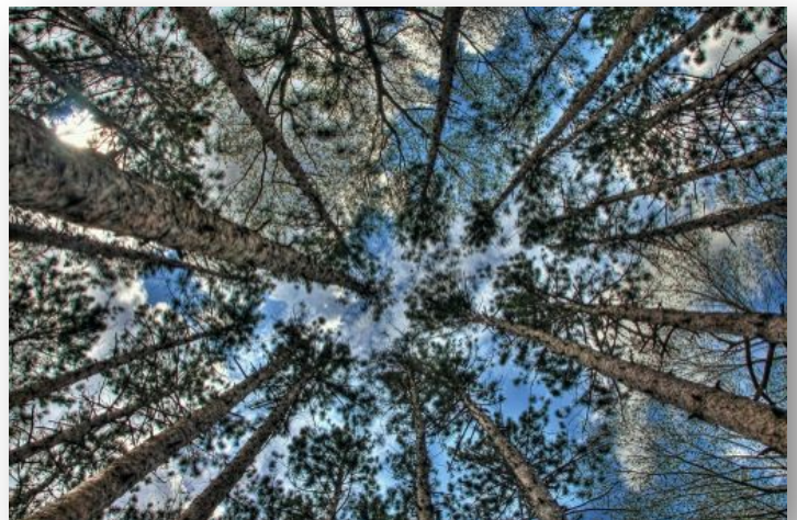
Forest Cathedral © Kevin Povenz