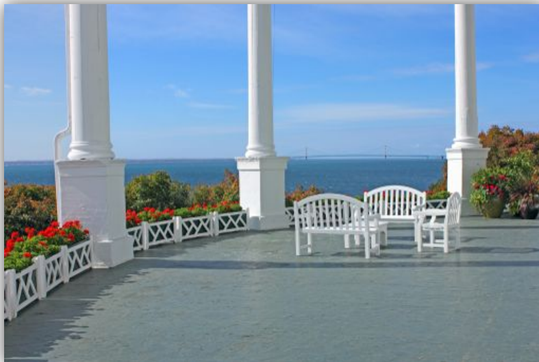
Grand Hotel Porch View

Sharon: I joined Woodland Photo Club when I was becoming more serious about photography, and looking to take it up as a hobby. Since I had not had formal schooling in photography, what I learned at club meeting (instruction and talking to fellow members) and from attending various seminars, and from watching videos which the club loaned out, formed me and helped me grow. I owe a big thanks to club members and SWMCCC for making knowledge available to me.