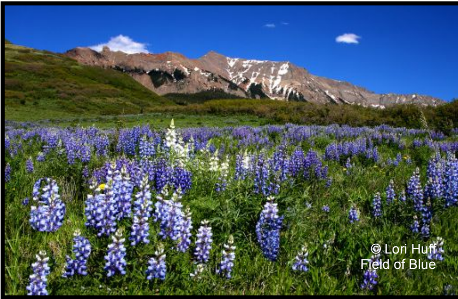
Field of Blue

WE SEEK TO PROMOTE THE KNOWLEDGE AND ENJOYMENT OF PHOTOGRAPHY THROUGH EDUCATION, PROGRAMS, ACTIVITIES AND COMPETITION.