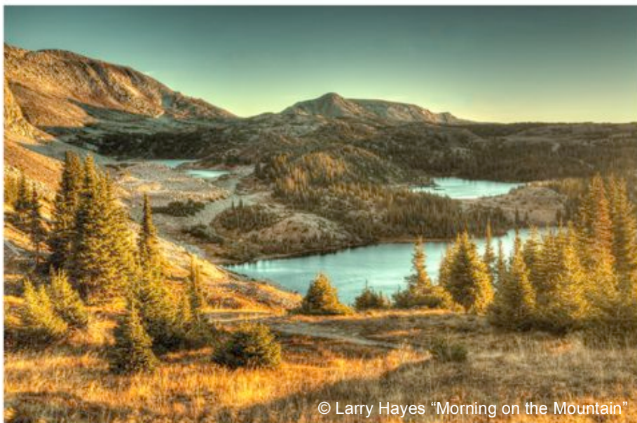
"Morning on the Mountain"