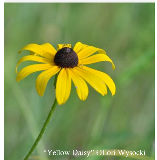
“Yellow Daisy”