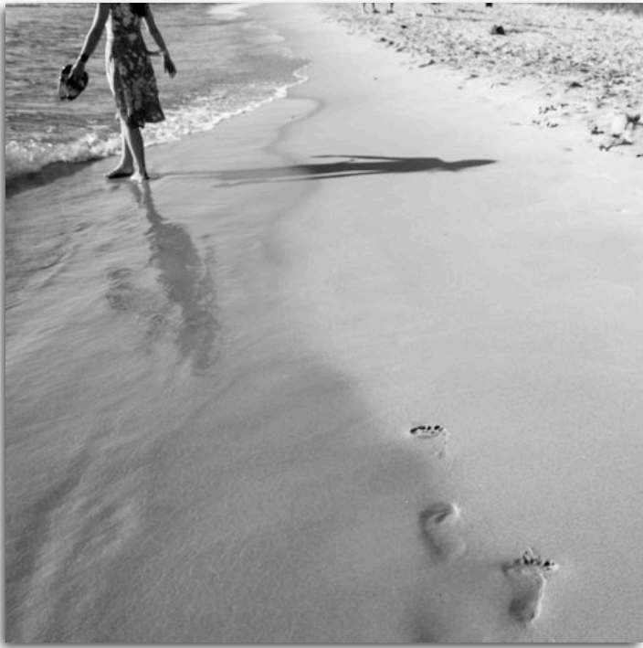
“Footprints” by Steve Scherbinski

LIMITATION: A showcase photo cannot be shown later in the regular competition , but could be submitted in SWMCCC fall or spring competition. This new category could be used to “test” the waters for unique or artistic photos for other competitions.