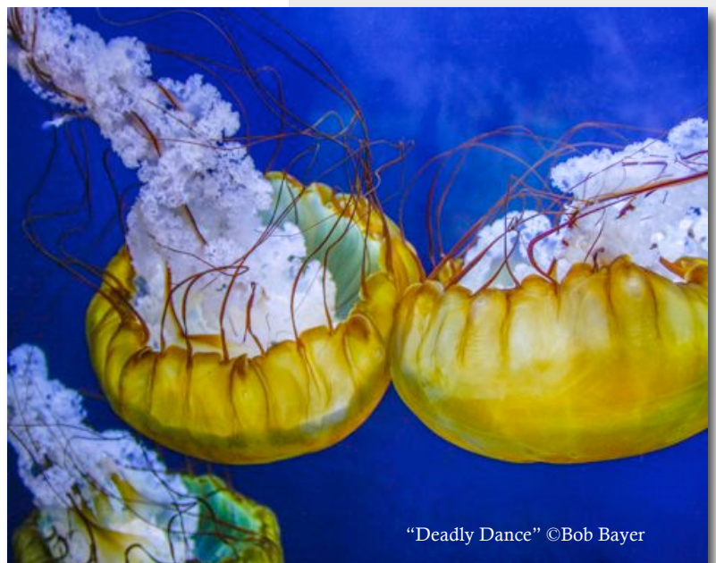
"Deadly Dance"