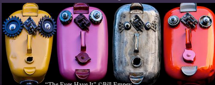
"The Eyes Have It"