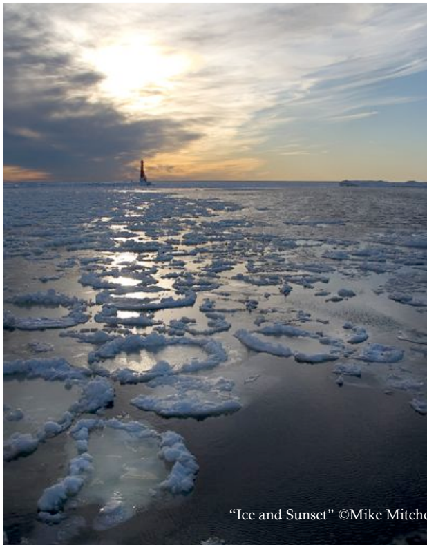
"Ice and Sunset"